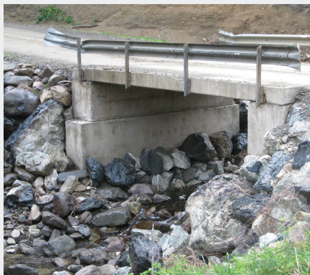
Examples of single span bridges using structural steel and reinforced concrete.

This guide is provided as a reference document and does not constitute a statutory obligation under the Resource Management Act 1991 or the National Environmental Standards for Plantation Forestry.