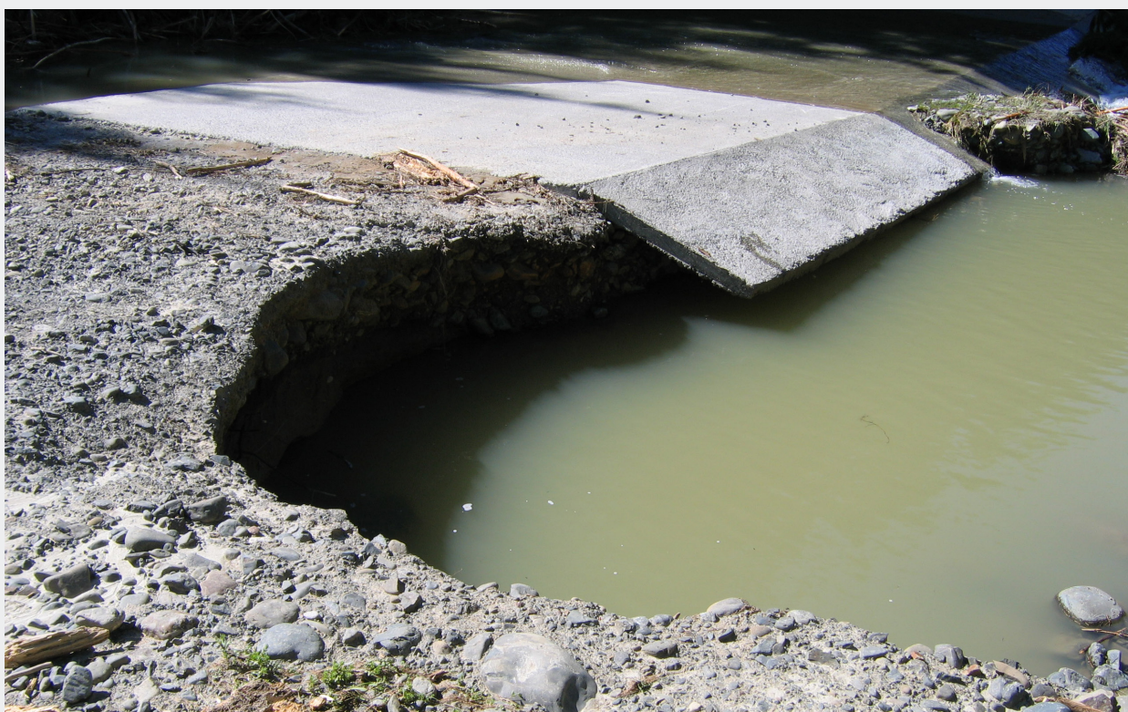
An example of a concrete pad crossing which will minimise sediment mobilisation caused by vehicle crossings.