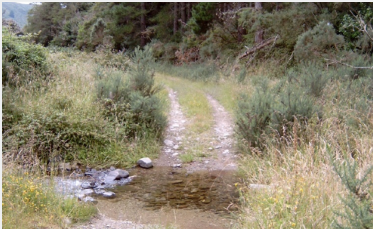
Clean ford with minimal sediment running down road into stream .

The use of fords can create significantly more sedimentation than other forms of river crossings.