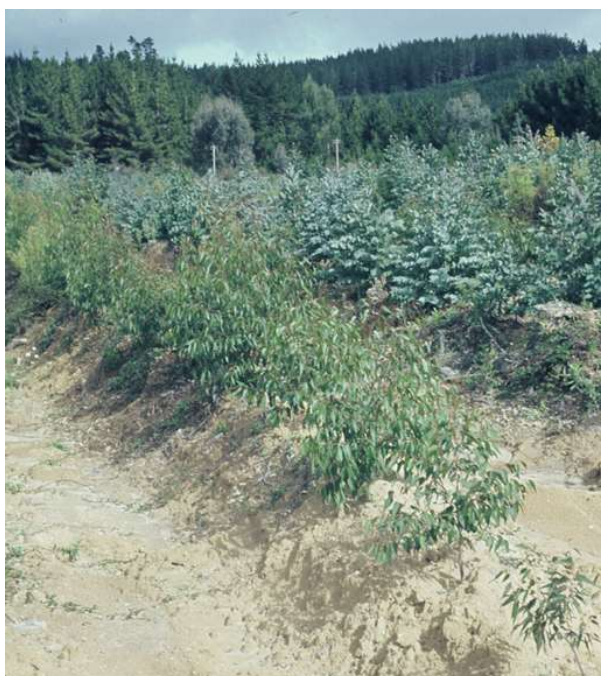
Well prepared eucalypt planting site

around seedling eucalypts with glyphosate, either with or without a shield. However great care is needed to avoid spray getting on to any of the seedling foliage. Caution is needed when applying herbicides around container-grown stock (especially peat pots which can absorb and concentrate the chemicals in the pot walls).