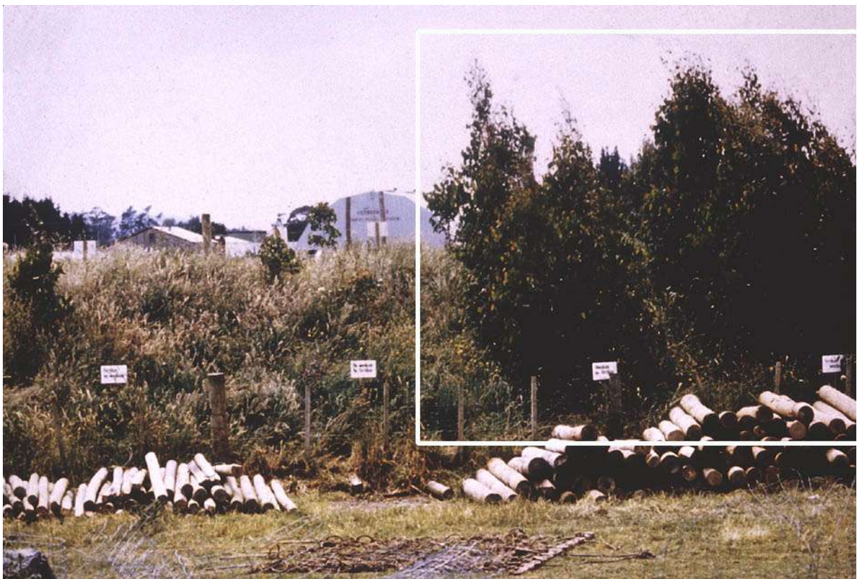
14 months after planting