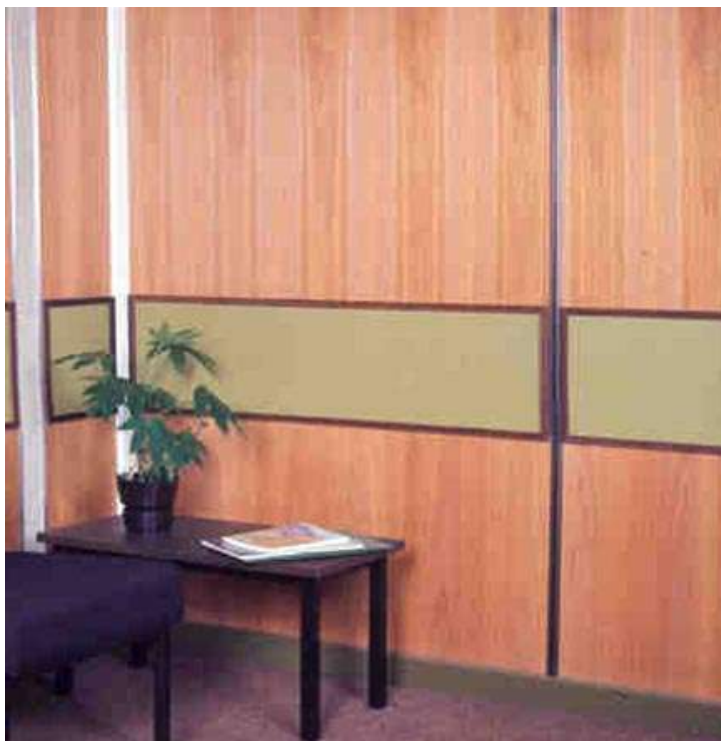
E. saligna veneer

Drying: The wood is easy to dry, but tangential surfaces are prone to surface checking. There may be slight collapse. Kiln drying from the green condition increases collapse, so initial air-drying is recommended.