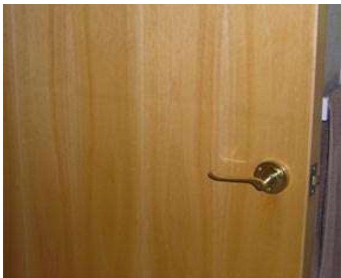
E. nitens veneer door