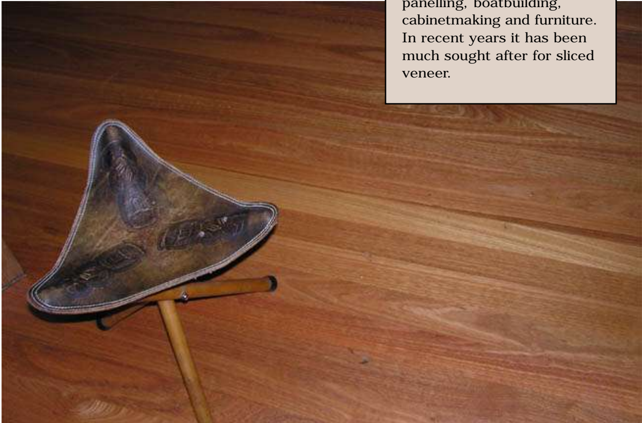
E. saligna flooring

The dark pink to red-brown heartwood colour characteristic of the eastern blue gums is much admired by many consumers but not favoured by wood processors. The sapwood is slightly paler. The timber has a fairly coarse, even texture. The grain is straight or slightly interlocked and gum veins are common. In Australia this species is used for general construction, cladding, flooring and panelling. It has potential for furniture construction and for production of structural plywood. It is suitable for engineering, veneers, decorative flooring, turnery, handles (bending) and knobs, and moderately suitable for panelling, boatbuilding, cabinetmaking and furniture. In recent years it has been much sought after for sliced veneer.