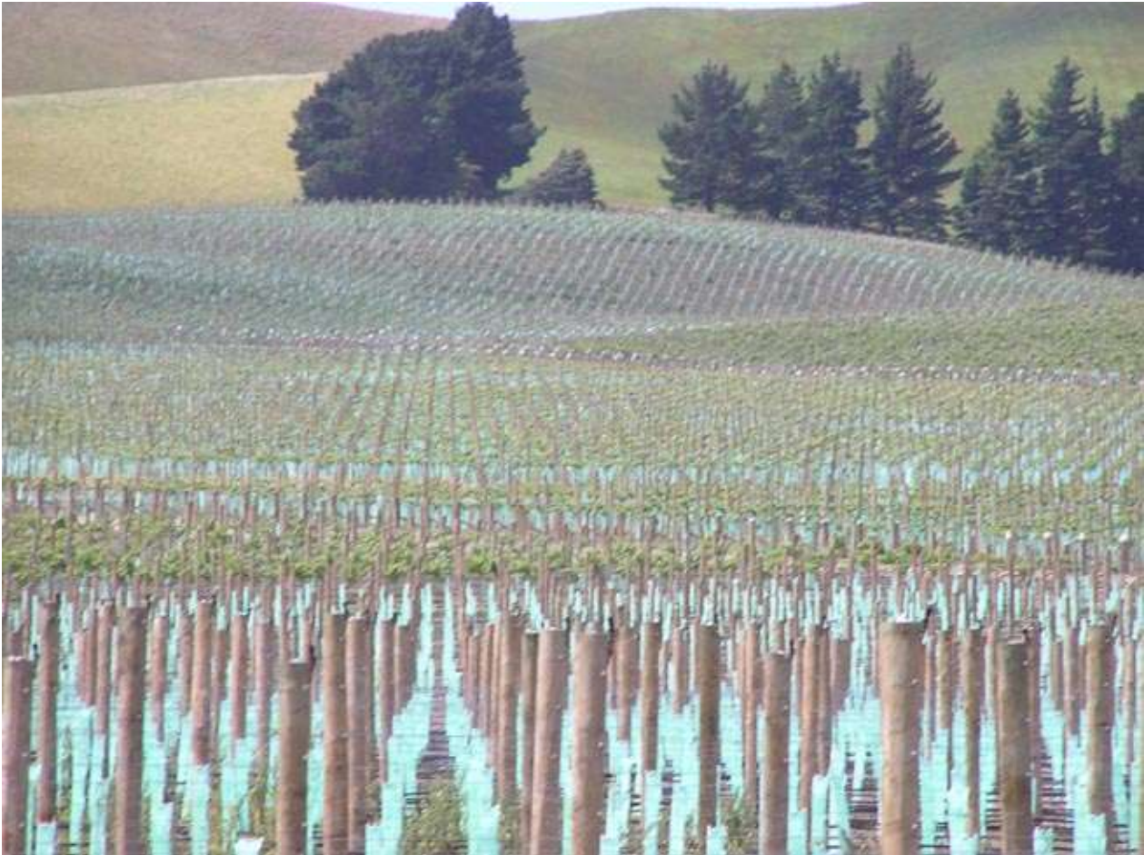
New vineyard development, an opportunity for naturally durable eucalypt posts