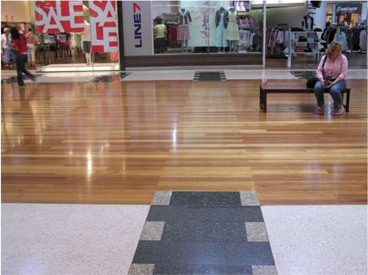
E. pilularis and E. saligna flooring