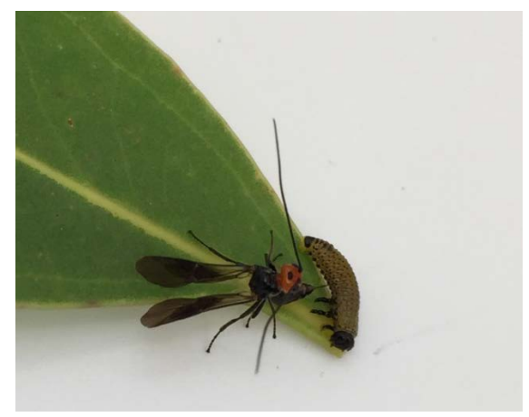
Eadya daenerys, proposed biological control agent