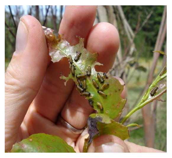
Eucalyptus tortoise beetle larvae, the target pest

Biological control, known also as biocontrol, exploits a naturally occurring process in which a natural enemy of a target pest is introduced to an area from which it is absent, to give long-term control of the