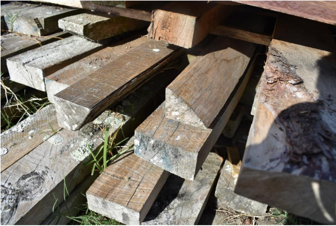
Figure: 11 – No incidence of borer was observed in the stack of untreated tōtara timber, which includes boards that clearly comprise a high proportion of sapwood timber.