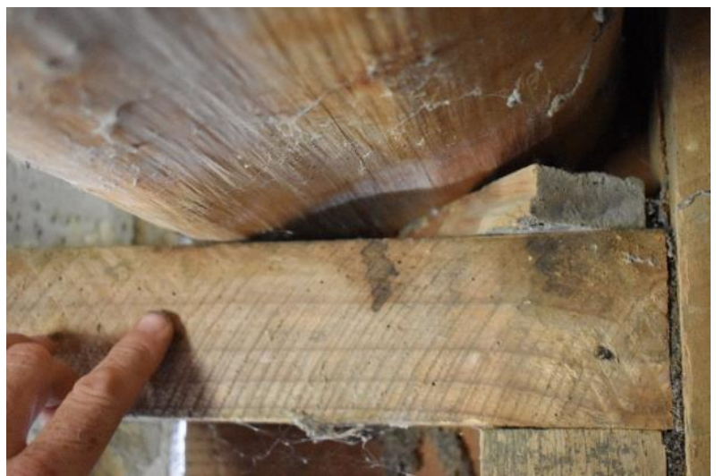
Figures: 22 & 23 – View to the large (butt) end of the 8.57m long tōtara beam, which rests on a piece of framing timber with house borer exit holes. However, no borer or rot is evident in any part of the untreated tōtara beam (N.B. the smooth natural round surface of the timber under the bark).