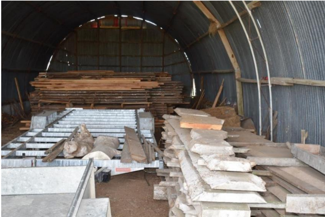
Figure: 3 – Totara slab and sawn boards stored in-fillet at the back of the shed. Slabs of kauri (grey-coloured) stored on right-hand side of the shed in foreground.