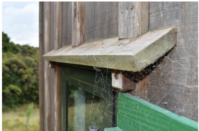
Figures: 16 & 17 – ‘Coloured’ pieces of totara timber (i.e. ones that are part sapwood/ part heartwood), were deliberately used in August 2009 as a performance trial of untreated tōtara in