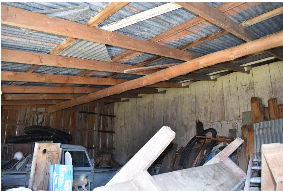
Figure: 21 The 8.57m long beam (under the rafters) has provided the mid-span rafter support since Oct. 1968, is an untreated tōtara pole, mostly still in the round form, but partly flat-sided (by axe) on top and near the butt end. The small end diameter is 160mm and the large end diameter is estimated at <30cm. The beam had the bark removed and was used green. Although borer is present in other timbers in the shed, no borer attack was observed at all in this (or the other) tōtara beam.