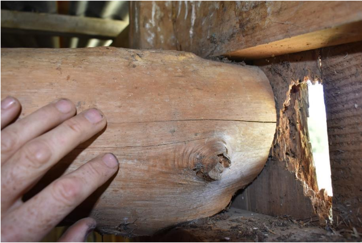
Figure: 21 – The small end of the beam has a diameter of 160mm and immediately abuts a rotting board of the exterior cladding. No borer or rot is evident in any part of the untreated tōtara beam. It has been in services for over 48 years.