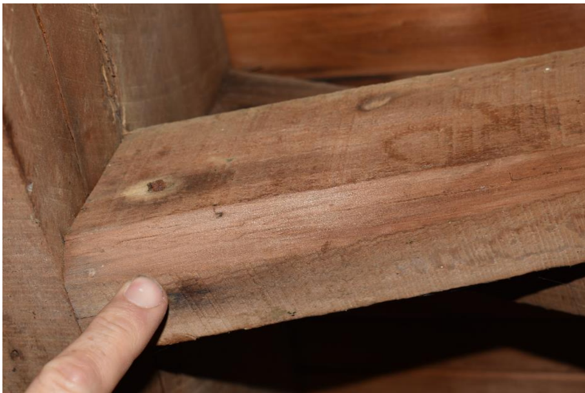
Figure: 9 – Obvious incidence of wane indicates the definite presence of sapwood on this piece of timber (in service since 1953). No evidence of borer was observed.

In summary the examples documented above include the following: