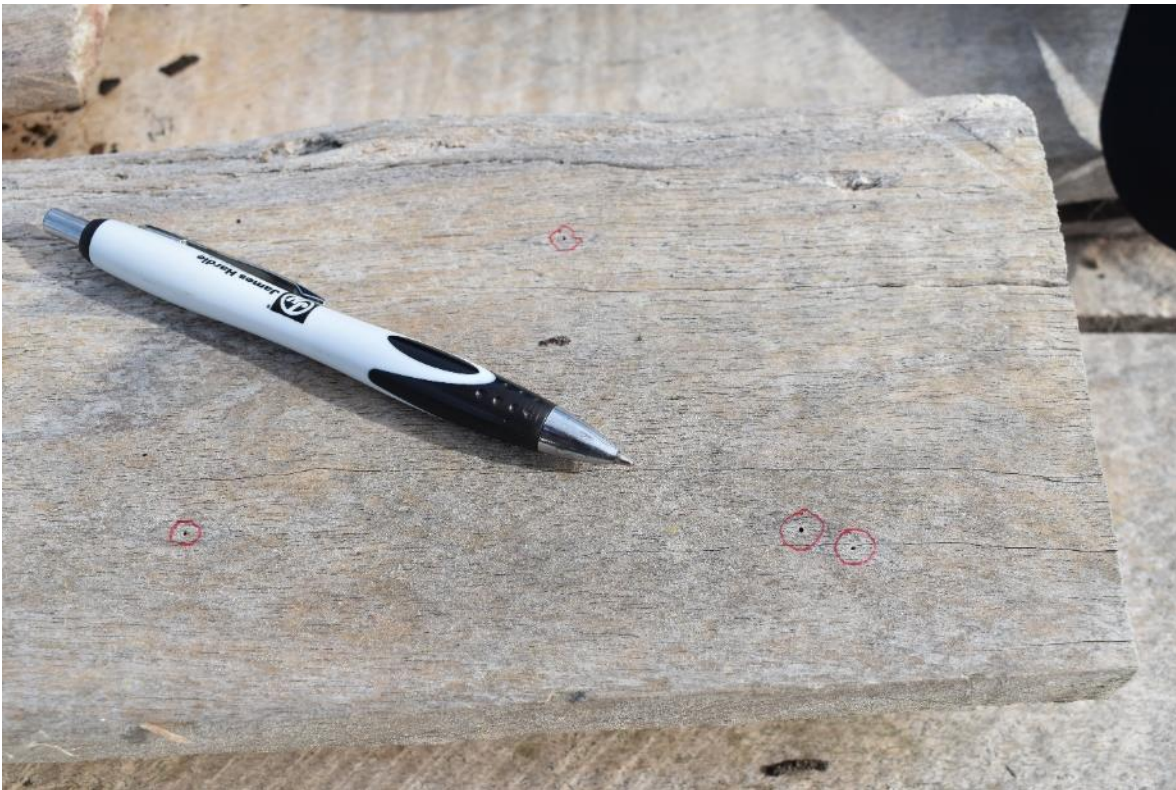
Figure: 12 – In contrast to the tōtara, an adjacent stack of taraire timber, milled at the same time, has been damaged by the common household borer ( Anobium punctatum ), despite being sprayed with Clear-Metalex & Turps.