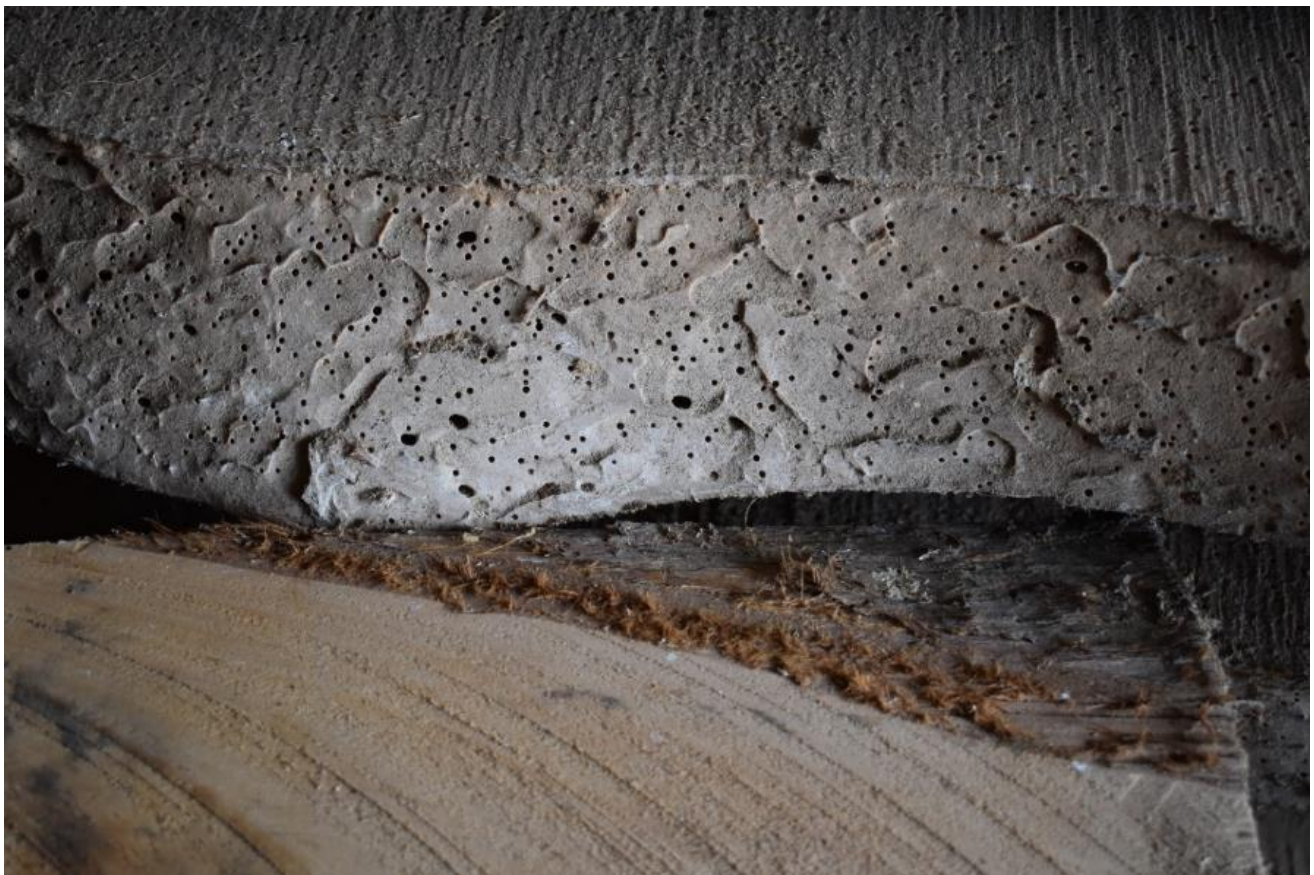
Figure: 4 – An example of kauri slab (in the top half of the photo) with sapwood riddled with the common household borer (small round holes) and the two-tooth longhorn borer (larger elliptical holes), in contrast a board of tōtara sapwood with the bark on it (in lower half of photo), without any sign of borer attack, despite being stored in close proximity to the kauri for over 7 ½ years.