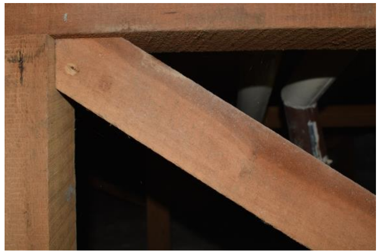
Figures: 6 & 7- Untreated tōtara subfloor framing of houses built in 1953 & 1962. No evidence of borer was observed. N.B. – the distinct colour variation on the same piece of timber (– notably the angled brace in the right-hand image) presumably indicates a transition zone from heartwood to sapwood timber.