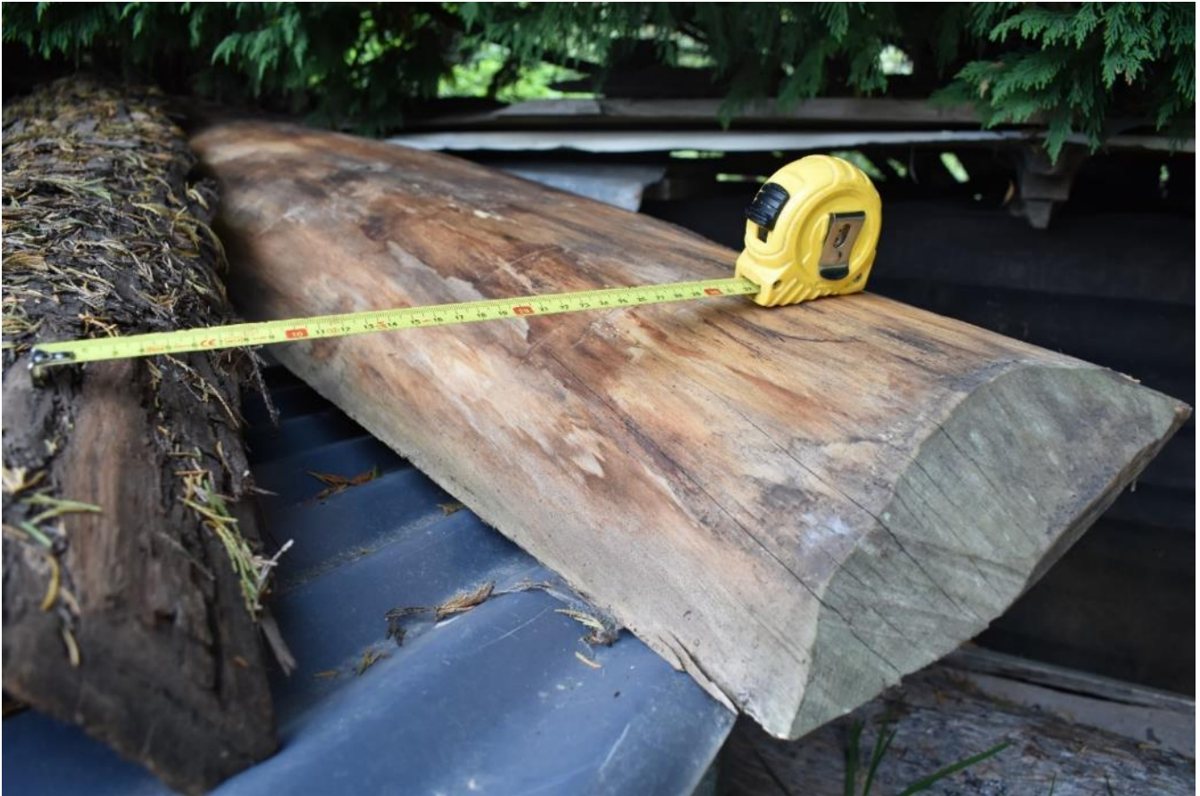
Figure: 15 – Even under the bark that had just been removed no evidence of borer damage was observed on the sapwood timber of the flitches that have been stored outside since milled in 2008 (i.e. over 8 years ago).