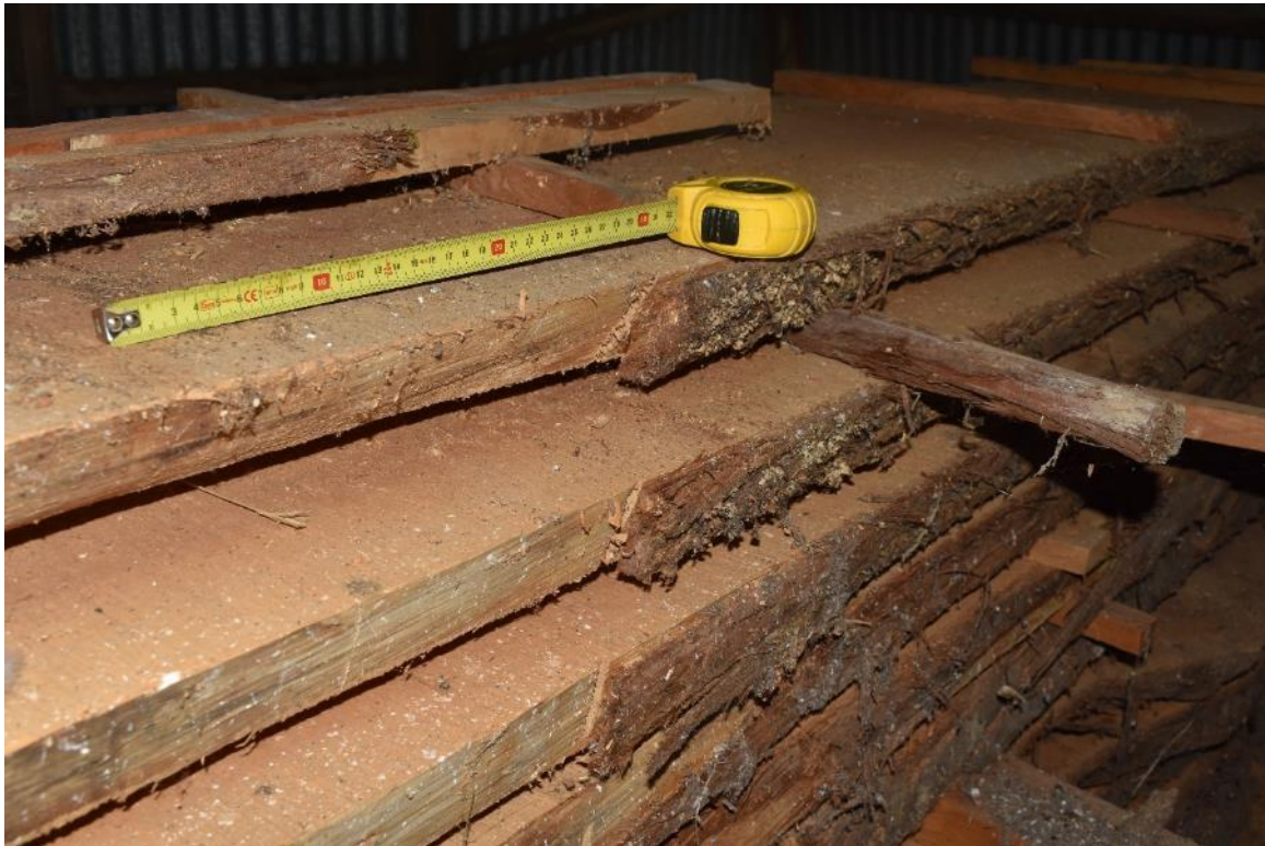
Figure: 5 – No evidence of borer damage was observed on any of the tōtara slabs or sawn lumber stored for over 7 ½ years in the same shed as the kauri slabs that were infested with borer.