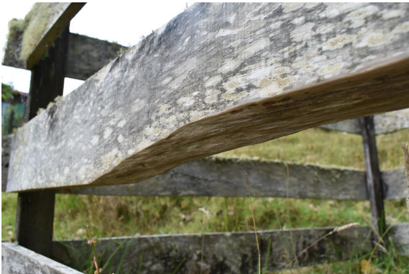
Figure: 18 – Untreated tōtara timber rails milled in 2008 and used in service outside since 2009 (i.e. 7 years so far). N.B. - many boards have wane and will therefore include a portion of sapwood. Although not expected to be durable in this exposed exterior application, no evidence of borer or rot/deterioration is yet evident.

exterior above ground situations. They form the weather shield hoods above the windows and door (and the support blocks). The lower drip-edges of the weather hoods comprise sapwood, the upper edges against the exterior walls are the darker heartwood. The colour transition is faintly visible on the end-grain in the above photograph. The interface with the wall was filled with clear silicone sealer and the timber painted liberally with two coats of a timber preservative oil (Red ENZ, Natural Timber Finish and Preservative). The three weather hoods are still in good condition now after more than 7 years' service without any maintenance or recoating.