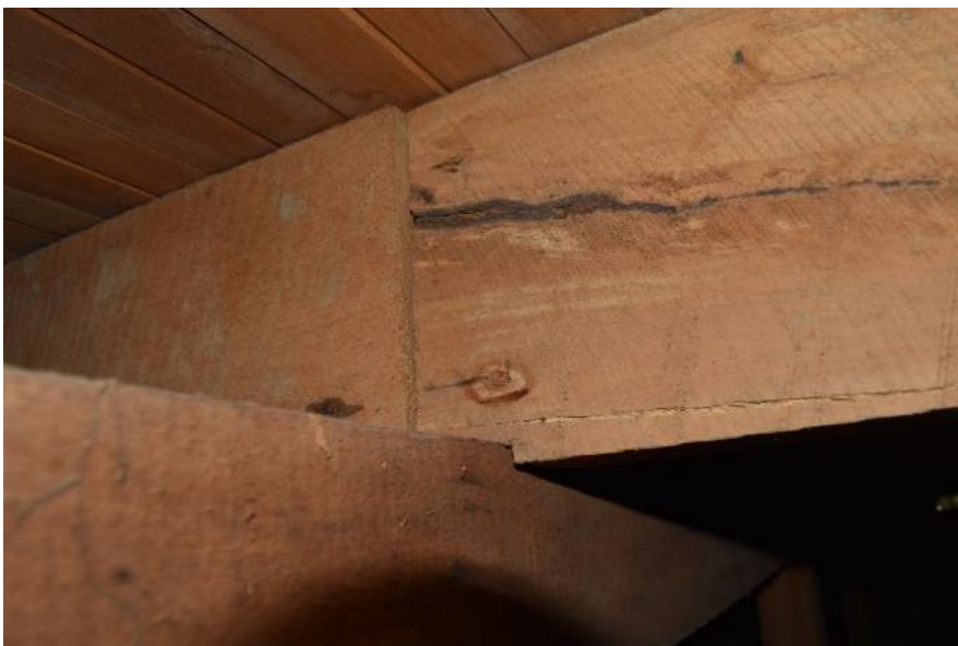
Figure: 8 – Bark encasement on one of the timber joists is presumably associated with a portion of sapwood content on this piece of timber. No evidence of borer was observed.