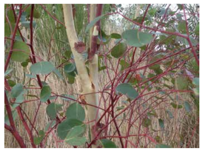
Removing a major fork in a 2-year-old tree (a) before and (b) after.