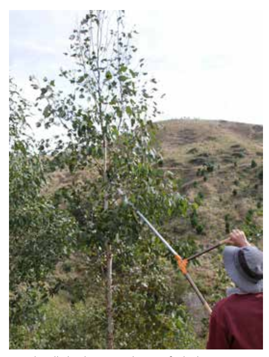
Long-handled pole-pruning loppers for higher pruning.