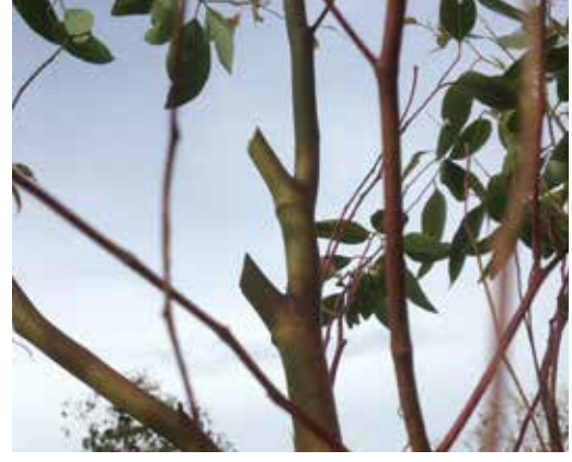
Branch stubs of up to 15 mm can be left to avoid damage to the main stem.