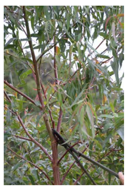
Removing double-leaders from the tree crown.

All pruning should be done during dry conditions, preferably in summer, to lessen the chance of fungal infections to the pruning wound. The fungal disease silverleaf is fatal for eucalypts if it invades a wound at any time of the year.